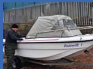
Optional extra include a folding canvas dodger