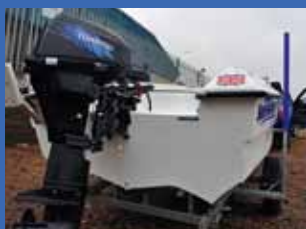
Our test boat was fitted with a 20hp Tohatsu

Contact Sea Swift Boats, tel: 01626 335904 or 07966 965795. Email: dave@seaswift.co.uk Web: www.seaswift.co.uk