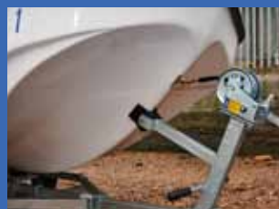
The boat has a very stable gull wing construction