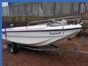
Sleek lines are enhanced by the stainless pulpit rail